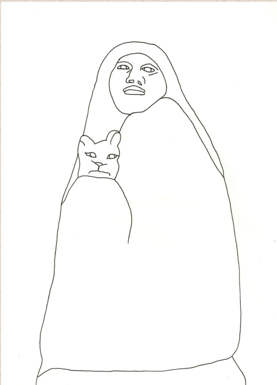
Outline drawing based on Allan Houser's My Cat