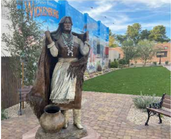
Marie Barbera, Wind on the Mesa , DCWM Collection

For: Display in Western Heritage Center, Prescott, September 19, 2019 – October 14, 2020