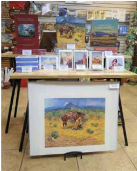
DCWM's Ranch Dressing Retail Store

Desert Caballeros Western Museum is a member of the Museum Store Association professional organization which establishes best practices and ethical standards for the field.