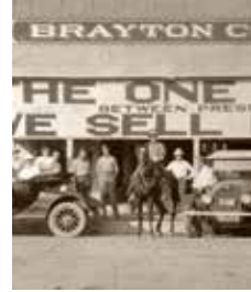
Brayton's General Store, DCWM archives

Summer/Fall 2020: acquisition of the remaining portion of the adjacent property block with funding from an anonymous donor