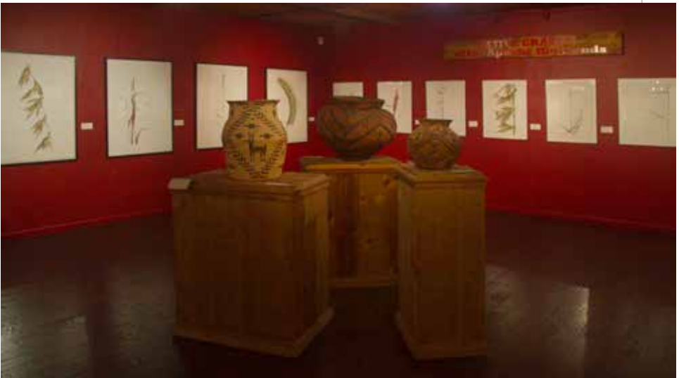
Native Grasses of the Apache Highlands, June 8-Oct. 20, 2019