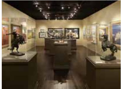
DCWM Permanent Collection, photo © Wayne Norton