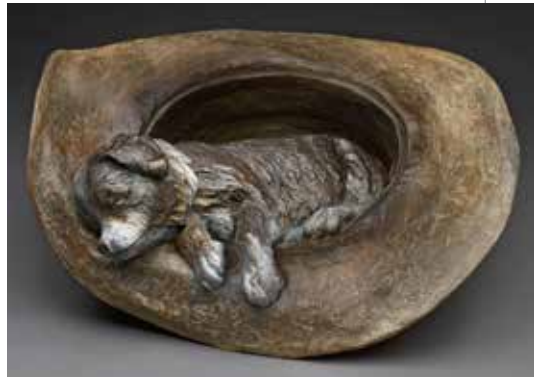
Cowgirl Up! Deborah Copenhaver Fellows ©, Never Touch a Cowboy's Hat , bronze, 2020 People's Choice Award Winner

136 pieces sold to 71 buyers from March 27 – September 30, grossing $385,451 (additional pieces sold in FY2021)