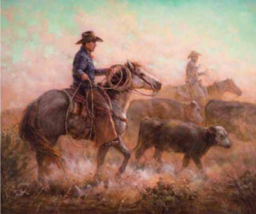
Shawn Cameron, Dusty Haze , oil, 30" x 36", DCWM Collection, 2020 Cowgirl! Up! Museum Purchase Award