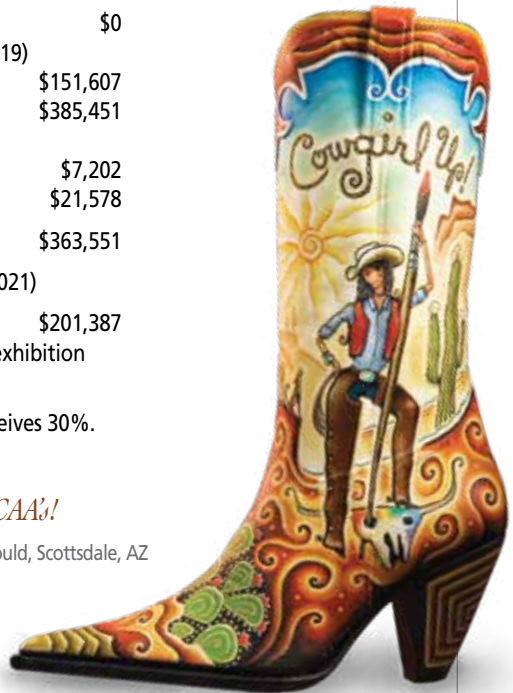
Boot image