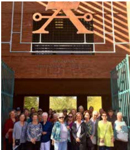
DCWM Volunteers at Arizona Heritage Center