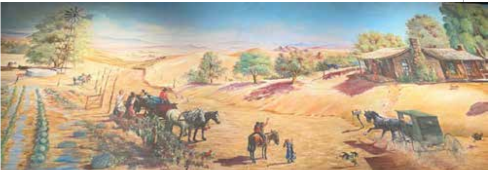
Hildred Goodwine, Buggy Scene , 1960s, oil on panels, approx. 48" x 144", DCWM Collection, Gift of the McKeever Family

approx. 90 books and periodicals, most dealing with Western art and culture, as well as art supplies