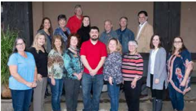
DCWM 2020 Staff