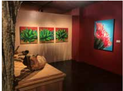
Flower Power: Desert Botanicals June 8-Oct. 20, 2019, photo © Wayne Norton

Many exhibitions in both Museum buildings are enhanced by the guidePORT™ audio tour system. Adult and student English and Spanish guidePORT™ tours made possible by Arizona Humanities.