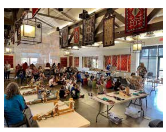
Kids' weaving program during Four Corners, Many Hands exhibition