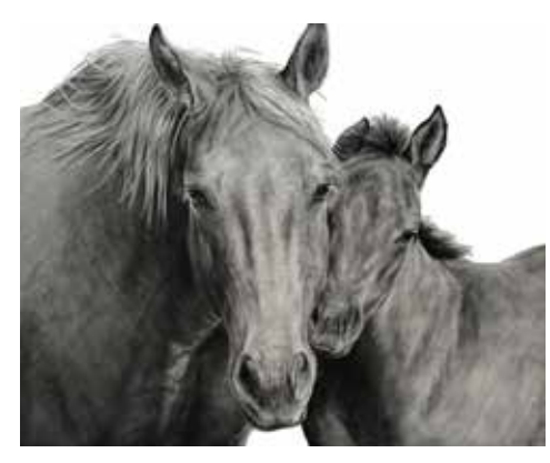
Julie Nighswonger ©, Muzzle Nuzzle, charcoal on canvas panel, Cowgirl Up! 2021 People's Choice Award Winner

176 pieces sold to 98 buyers from March 26 – September 5, 2021 grossing $401,795