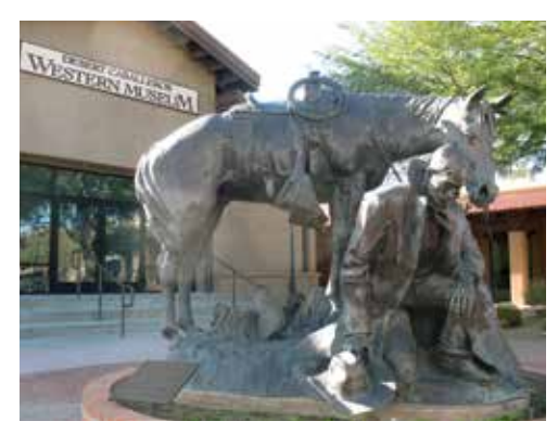
Joe Beeler ©, Thanks for the Rain, DCWM Collection

The Boyd Ranch will be a regionally recognized facility for educational, equestrian, and recreational activities that preserve Western heritage.