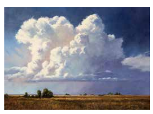
Linda Glover Gooch ©, Hallelujah! , oil, 30" x 40", Cowgirl Up! 2021 Museum Purchase Award

Malachite 1 display piece, 1 large crosscut Copper 3 display pieces, 2 molded forms