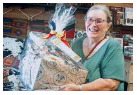
A box full of retail items won at the Members' Appreciation Night