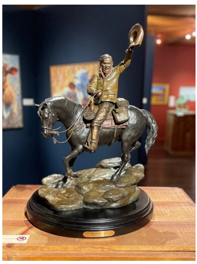
Star York ©, Home at Last, bronze, ed. 35, in Cowgirl Up! 2021