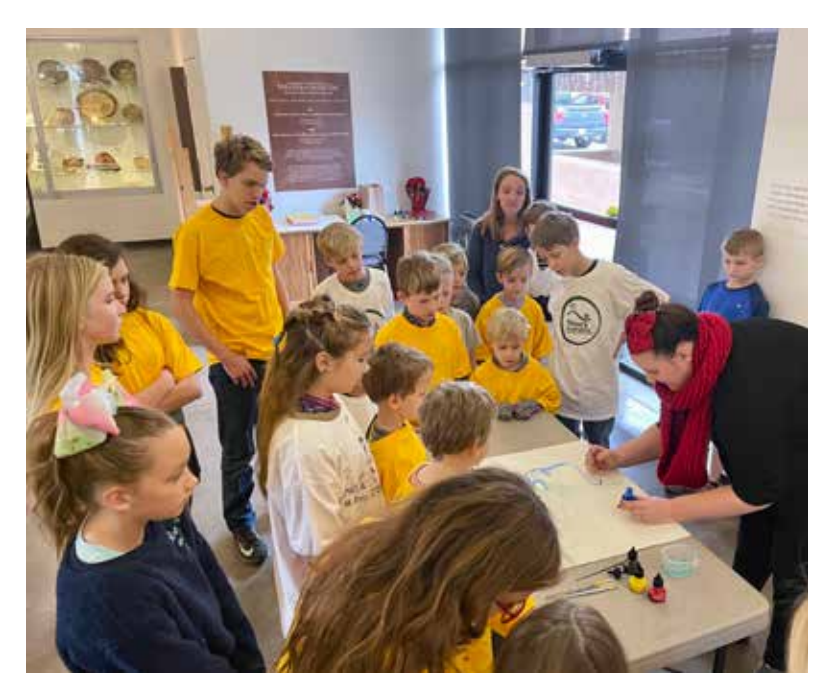
Holiday youth workshop at the Museum funded by a Donation from Cox Charities.