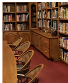
DCWM Eleanor Blossom Library