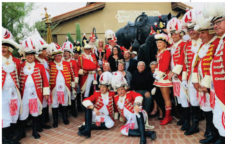
Red Sparks