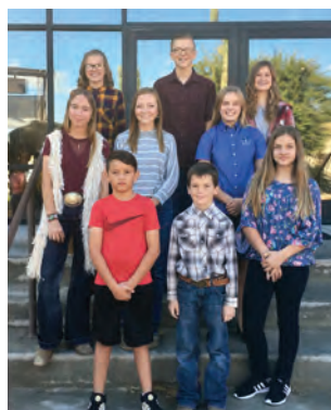
2019 Cowboy Poetry Award Winners