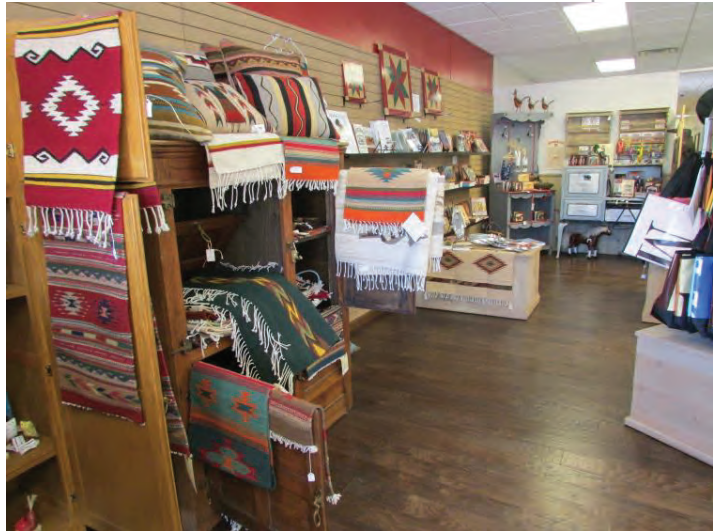
DCWM's Ranch Dressing Retail Store

Desert Caballeros Western Museum is a proud member of the Museum Store Association professional organization which establishes best practices and ethical standards for the field.