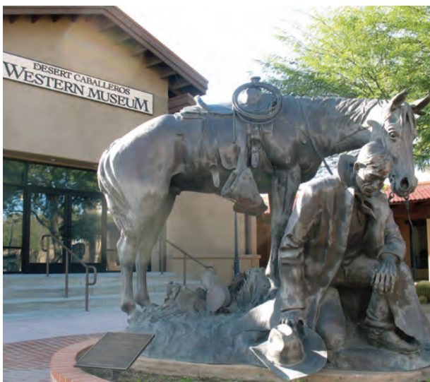
Joe Beeler © Thanks for the Rain , DCWM Collection

The Boyd Ranch will be a regionally recognized facility for educational, equestrian, and recreational activities that preserve Western heritage.