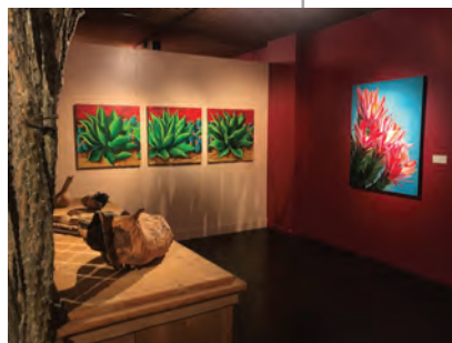
Flower Power: Desert Botanicals June 8-Oct. 20, 2019