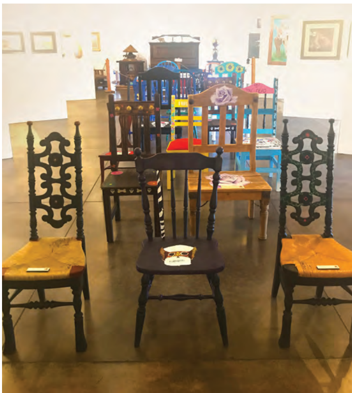
Day of the Dead exhibition, Oct. 26 – Nov. 4, 2018, memorial chairs created by Wickenburg High School Advanced Art Students