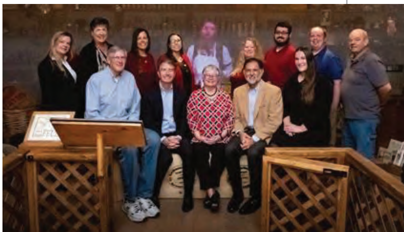
DCWM December 2018 Staff Photo