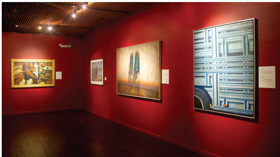
The West Observed: The Art of Howard Post exhibition organized by the Tucson Museum of Art and Historic Block. July 21 – Nov. 25, 2018