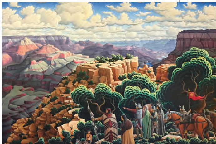
Kim Wiggins, Cardenas at the Grand Canyon 1540 A.D. , 2012, oil on canvas, 48" x72", Museum purchase Art Acquisition funds

For: display in Western Heritage Center, Prescott, beginning September 19, 2019