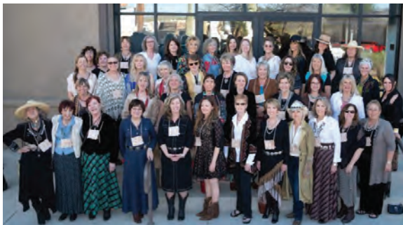
Cowgirl Up! 2019 artists