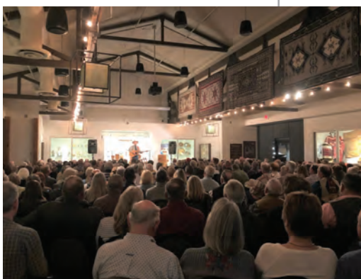
Dave Stamey concert

Facebook: 3,628 followers Twitter: 324 followers Instagram: 1,230 followers Ranch Dressing Social Media followers: 453 Facebook: 314 followers Instagram: 139 followers