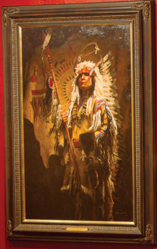
Small white informational label next to the painting.