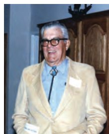
Aiken Fisher, DCWM archives