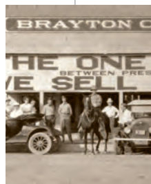
Brayton's General Store