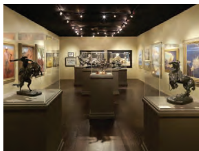
DCWM Permanent Collection