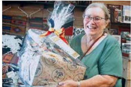
A box full of retail items won at the Members' Appreciation Night