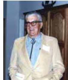
Aiken Fisher, DCWM archives