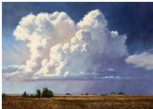
Linda Glover Gooch ©, Hallelujah! , oil, 30" x 40", Cowgirl Up! 2021 Museum Purchase Award