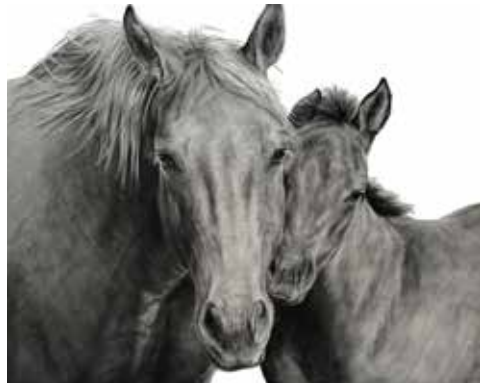
Julie Nighswonger ©, Muzzle Nuzzle , charcoal on canvas panel, Cowgirl Up! 2021 People's Choice Award Winner

176 pieces sold to 98 buyers from March 26 – September 5, 2021 grossing $401,795