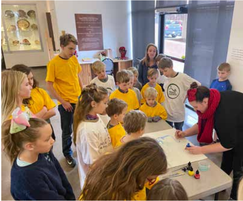
Holiday youth workshop at the Museum funded by a Donation from Cox Charities.