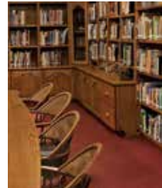
DCWM Eleanor Blossom Library