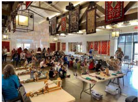
Kids' weaving program during Four Corners, Many Hands exhibition