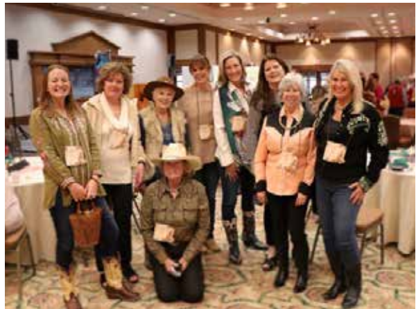
A few of the Cowgirl Up! 2021 artists