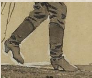
Cowboy Boots (Pairs)