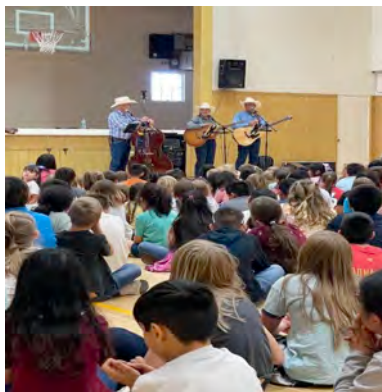
Cowboy Poetry assembly at Hassayampa Elementary School