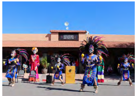
Folklorico Dancers for the opening of Mexican Folk Art: Artesanía del Pueblo exhibition.

September 30 – November 26, 2023 Fisher and Changing Galleries, main museum Special thanks to SRP for community program funding