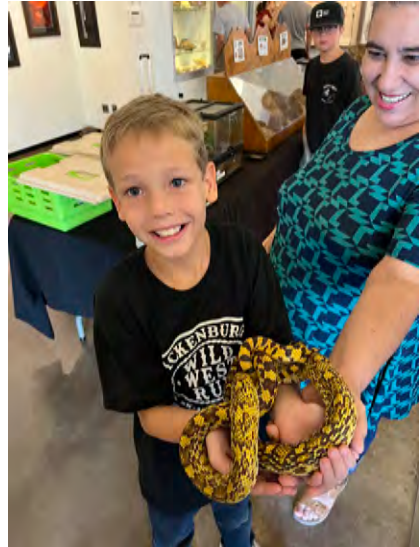
Wildlife Arizona presentation