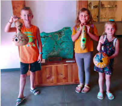
Family Friday presented by the Etnyre Foundation

Johnson Historical Museum of the Southwest, $90,000