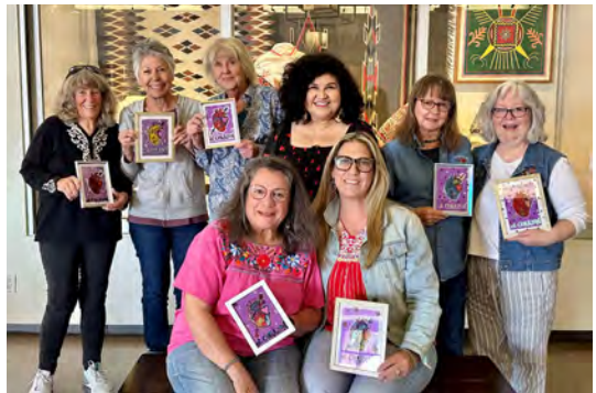
Crafty Chica workshop funded by Arizona Humanities