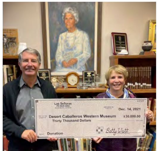
Las Se oras de Socorro annual donation