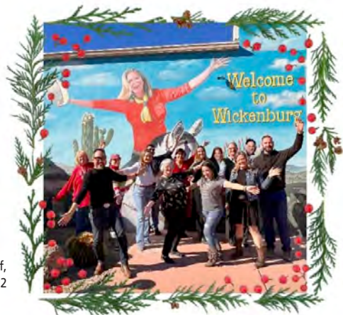
DCWM staff, December 2022