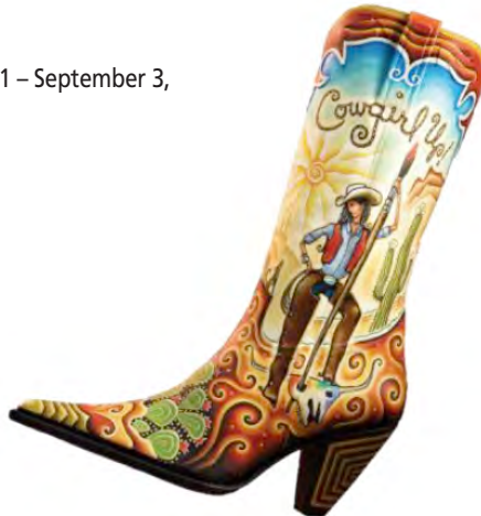
Boot illustration @ Tim Zeltner/i2iart.com

221 pieces sold to 120 buyers from March 31 – September 3, grossing $905,613