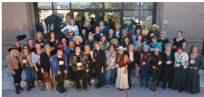
Cowgirl Up! 2023 artists