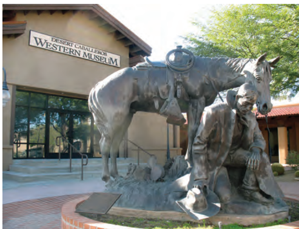
Joe Beeler ©, Thanks for the Rain , DCWM Collection

The Boyd Ranch will be a regionally recognized facility for educational, equestrian, and recreational activities that preserve Western heritage.