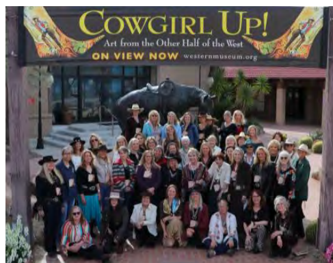
Cowgirl Up! 2024 artists