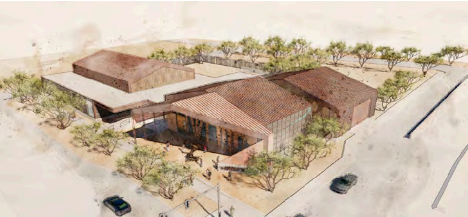
Architect's rendering of the proposed new expansion by Studio Ma.

The 12,020 square-foot Art Museum and Pavilion will be located directly across the street from the current location and is envisioned as a state-of-the-art facility that will nestle into the heart of downtown Wickenburg. Brilliantly designed by the renowned architectural firm, Studio Ma.