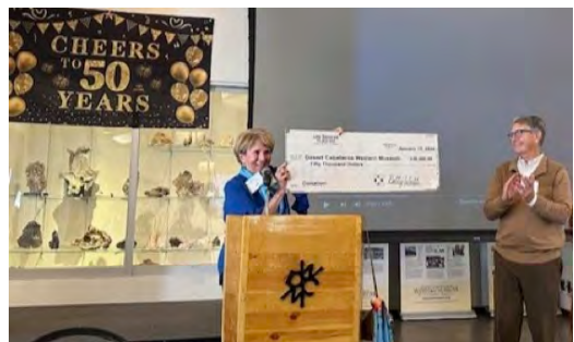
Las Se oras de Socorro annual donation