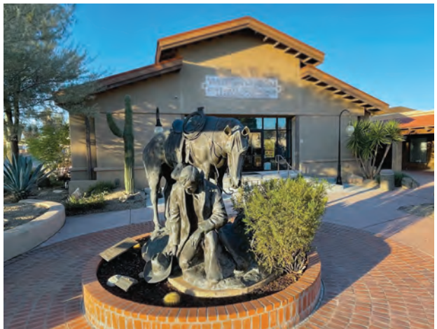
Joe Beeler ©, Thanks for the Rain , DCWM Collection

The Boyd Ranch will be a regionally recognized facility for educational, equestrian, and recreational activities that preserve Western heritage.