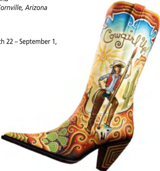
Boot illustration @ Tim Zeltner/iZiart.com

177 pieces sold to 115 buyers from March 22 – September 1, grossing $533,796