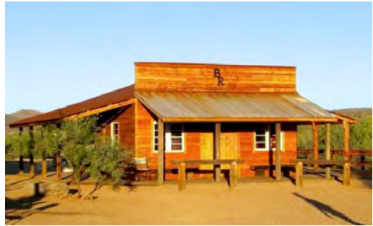
Boyd Ranch Educational Center