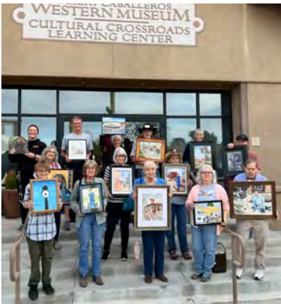
Paint Wickenburg Plein Air Event

Jan. 12-14: Mata Ortiz Potters and Weavers Feb. 24: Paint Wickenburg Plein Air Event Aug. 26: West of Center, Wickenburg Art Club