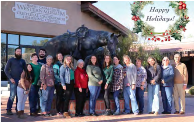
DCWM staff, December 2023

Visitor Services Associate Dec. 2023-Jan. 2024 Housekeeper & Events Assistant Director of Marketing Director of Development Facilities Assistant since Oct. 2023 Executive Director Director of Education Director of Facilities Visitor Services Associate to Nov. 2023 Accounting Assistant Director of Business Operations Executive Assistant to May 2024 Cuseum Data Entry Jan. 2024-July 2024 Deputy Director and Curator to Feb. 2024 Boyd Ranch Caretaker Boyd Ranch Ranch Hand Boyd Ranch Ranch Hand Boyd Ranch Ranch Hand from April 2024 Boyd Ranch Assistant Caretaker Assistant Director of Education Collections Manager Curator from Jan 2024- June 2024, Chief Curator and the Dita and John Daub Curator of Western Women's Art from June 2024 Executive Assistant from June 2024-Aug 2024 Visitor Services Associate to Sept. 2024 Adjunct Curator of History Visitor Services Associate: Administrative Assistant from Aug. 2024 Visitor Services Manager to Aug. 2024; Development Coordinator from Aug. 2024 Senior Visitor Services Associate/Weekend Supervisor Preparator to July 2024 Visitor Services Associate Retail Operations Manager to Aug. 2024; Visitor Experience Manager from Aug. 2024