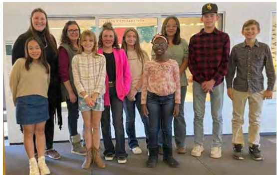
Cowboy Poetry 2023