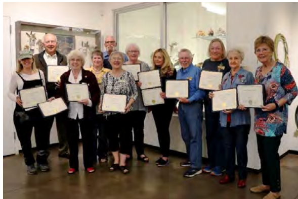
Volunteer awards 2024